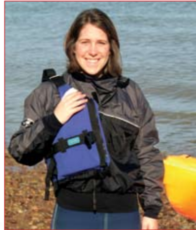
A wetsuit and cap combination

Dry suits are increasingly becoming a popular option for anyone fishing in cooler waters from a sot especially now that the cost is becoming more affordable.