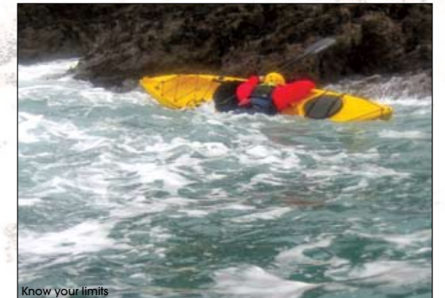
Know your limits

If you ever find yourself having drifted around a headland or in situations where the conditions have changed because you have become too focused on fishing you will have some previous experience to draw upon to help get you out of trouble.