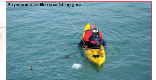
Be prepared to ditch your fishing gear

On safety clinics most paddlers are shocked at just how hard it is to flip over a sot with fishing rods attached to the rod holders. Ditch the rods if you have to right the kayak. This is a good reason to avoid taking your best rod and reels afloat. It also means that your best gear will not get crudded up with salt water.