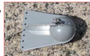
Para-vanes keep you line at a constant depth while you paddle

Just trolling a line with a few lures can often be very effective especially if you invest in a paravane type of system which will hold the line at a constant depth as you paddle.