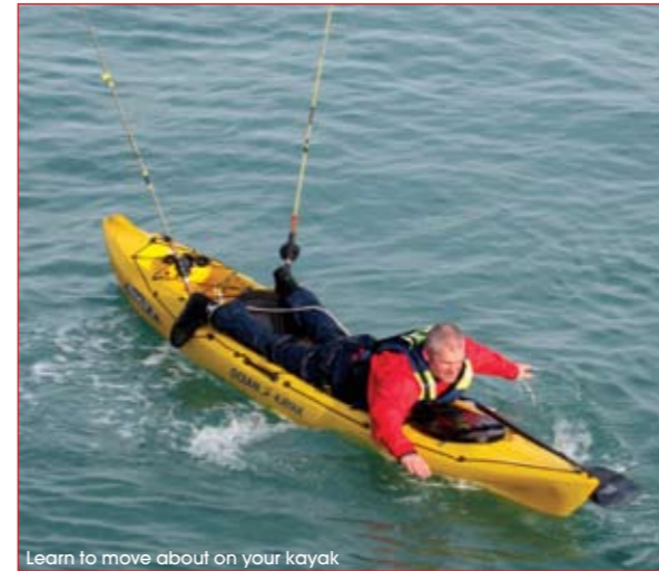
Learn to move about on your kayak

On my courses I try to give paddlers the opportunity to experience more challenging conditions than they might normally go out in. Knowing your limits is crucial to developing a safe attitude when fishing.