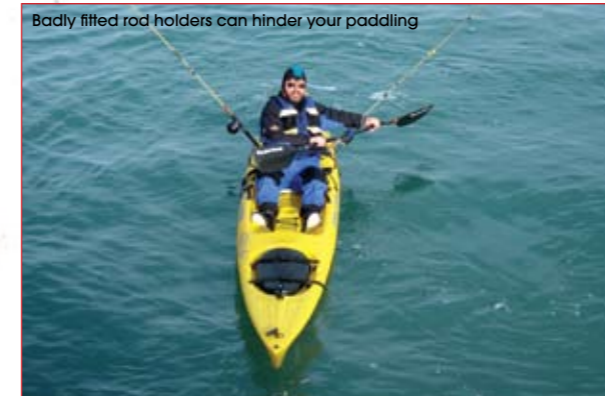
Badly fitted rod holders can hinder your paddling

There is no need to rush out and buy the latest angler version of a sit-on-top kayak with rod holders, bait box, fish spotter mounts or other extras. Wait until you have got hooked and know just what you need before you part with your cash. Check out kayak fishing forums for some handy hints and advice. They are a friendly place and your paddle sport experience will be welcomed.